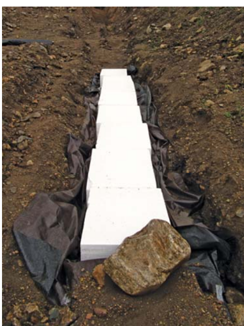
The reduction in loading and deformation due to geofoam's compressibility will likely improve the performance of this Weber Canyon pipeline during and after a major seismic event along the fault area.